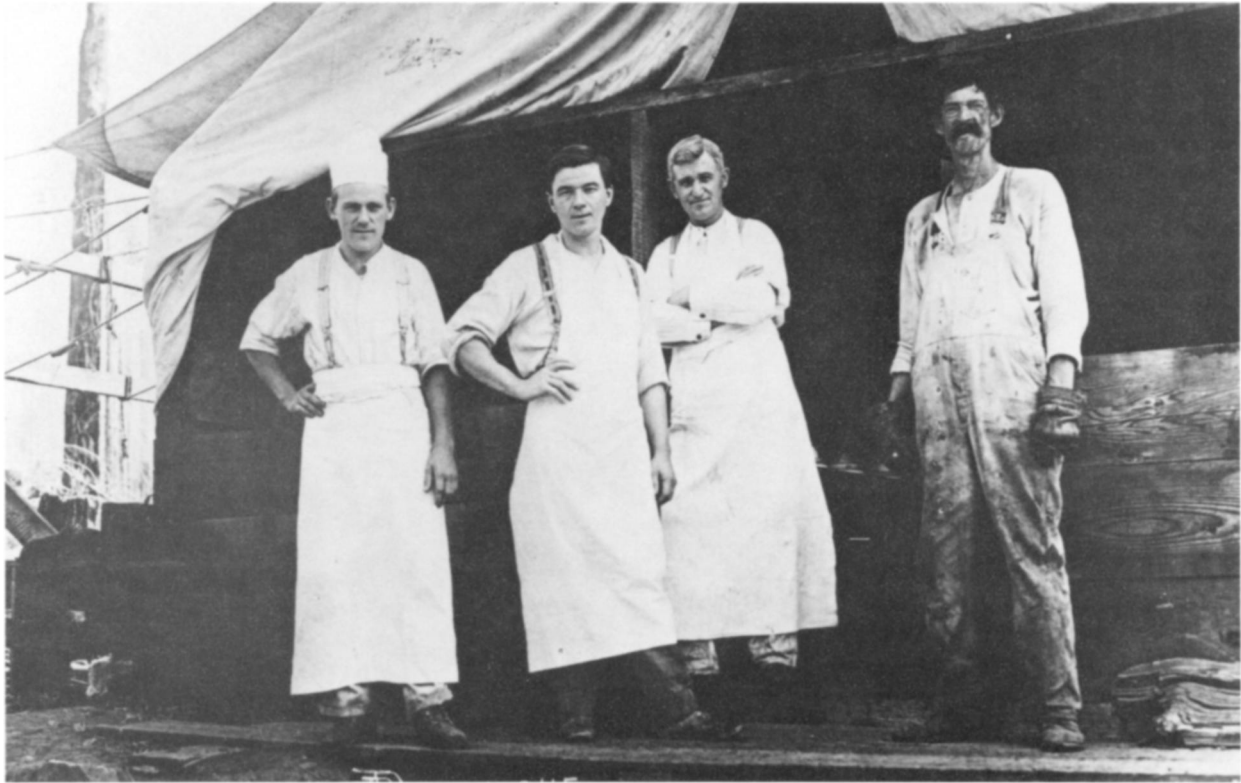
A cookhouse crew of the Silver Falls Lumber Company near Silverton, Oregon. From left: baker or second cook, cook, dishwasher, and bull cook.