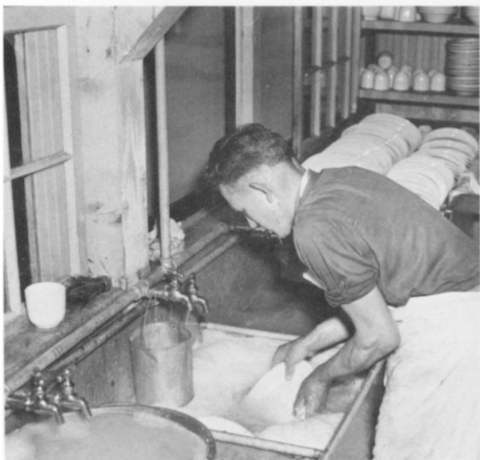
The men and women pictured above worked in cookhouses in Washington and northern California during the 1940s.