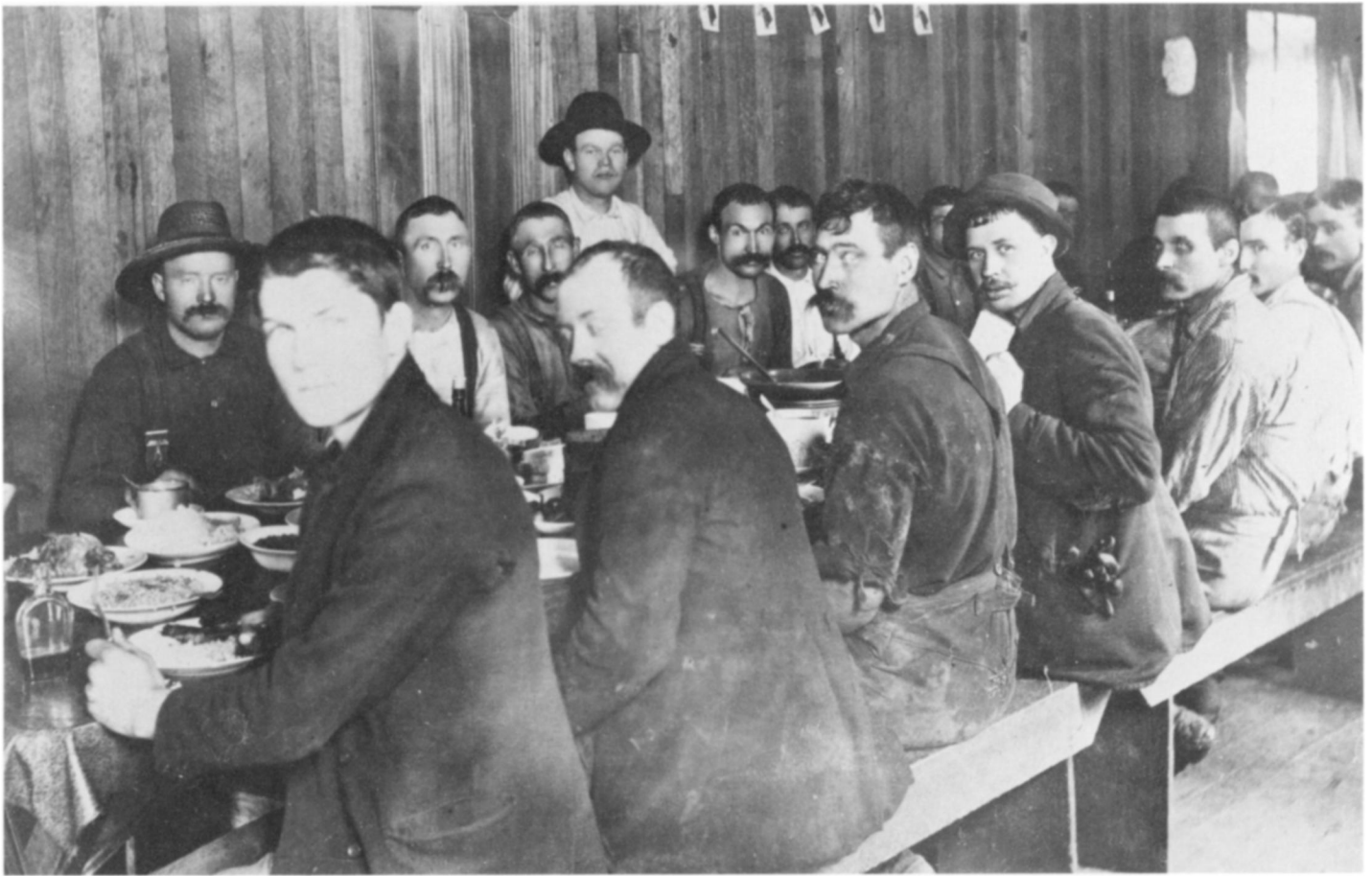
Mustachioed loggers enjoy a hearty breakfast at a camp dining room near Sedro Woolley, Washington, ca. 1900.