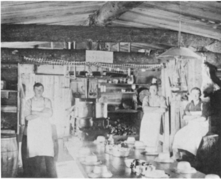
A crudely lettered sign above the stove in this Minnesota cookhouse (1911) reads "Notice: No Talking at Tables."