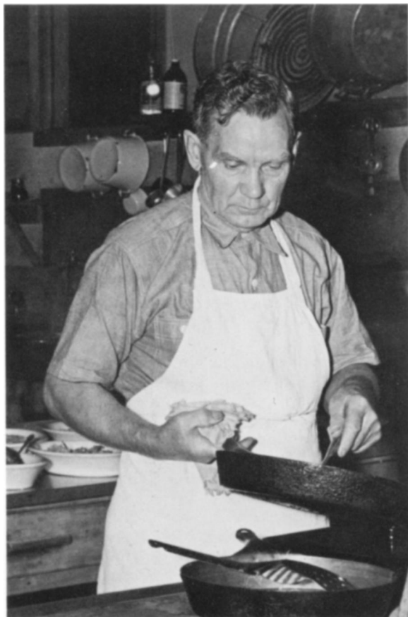
The camp cook of the Meadow River Lumber Company, Rainelle, West Virginia.