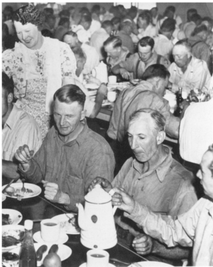
Hungry Weyerhaeuser loggers pitch into a "lovely meal" at a big mess hall in Washington, ca. 1947.